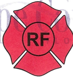
Lightweight Truss Roof & Floor