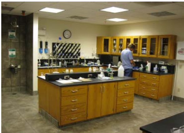
Operator working in the North RO Plant