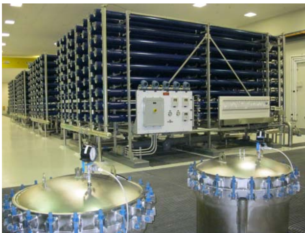
North RO Plant Production Trains

The amount of concentrate removed in the RO process is approximately 20% of the feed water entering the system. The concentrate water is not drinkable nor is it suitable for irrigation due to the high dissolved solids concentration.