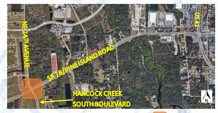
Enlarged map on following page.